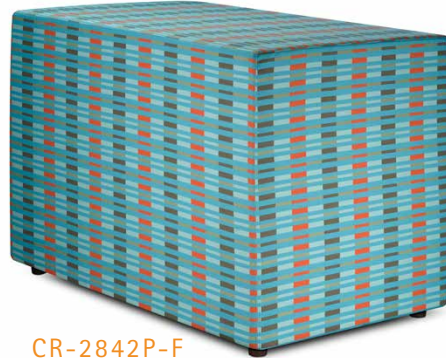
CR-2842P-F partition (large) 28x42