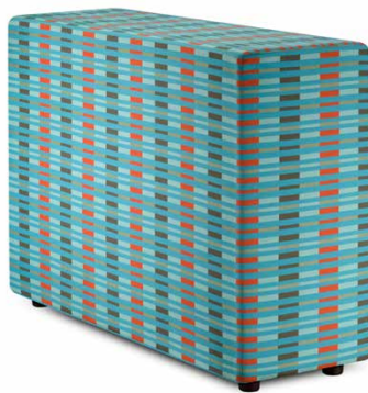
CR-1442P-F partition (medium) 14x42