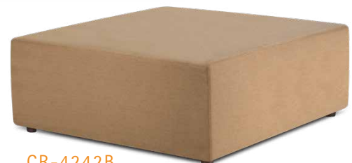
CR-4242B base (large) 42x42