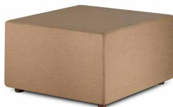
CR-2828B base (small) 28x28