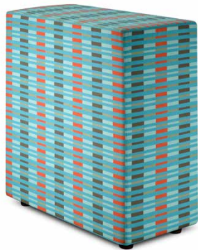
CR-1428P-F partition (small) 14x28

CAL 133 fabric treatment may be applied for an additional fee per yard.