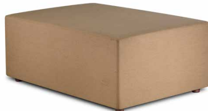
CR-2842B base (medium) 28x42