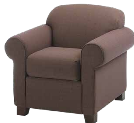
QU-C-RA chair - rolled arm