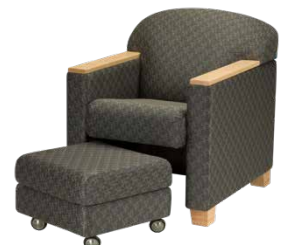
QU-CSO chair/slide-out ottoman available in all arm styles shown: QU-CSO-FC