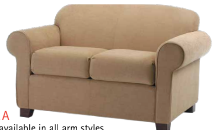
QU-L-RA loveseat - available in all arm styles