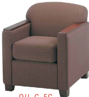
QU-C-FC chair - flat cap