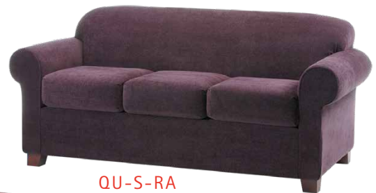
QU-S-RA sofa - available in all arm styles