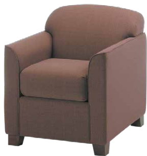
QU-C-TA chair - tapered arm

www.transformationsfurniture.com/options