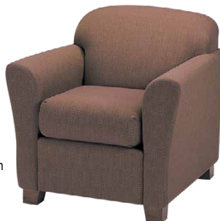
QU-C-TX chair - tufted arm