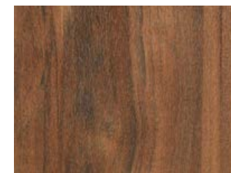
Avante Kaffe Laminate