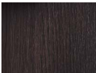
Obsidian Oak Laminate

Many Transformations products incorporate exposed wood and laminate details, including feet, legs, arms and table or bench tops.