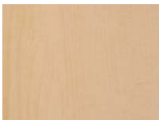
American Natural Laminate