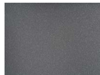
Shark Gray Laminate