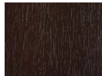
Tannery Maple Laminate