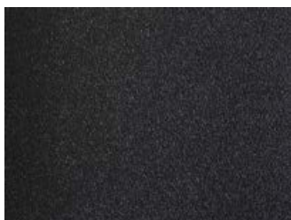
Ebony Starlight Laminate