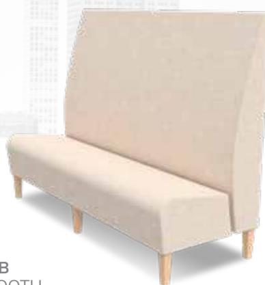
RS-S3-72-EXTHB 72" EXTENDED HIGH BACK BOOTH 72" W X 28" D X 54" H