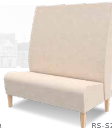
RS-S2-48-EXTHB 48" EXTENDED HIGH BACK BOOTH 48" W X 28" D X 54" H