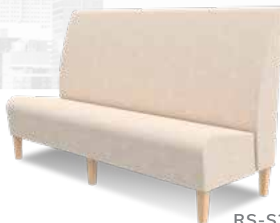
RS-S3-72-HB 72" HIGH BACK BOOTH 72" W X 28" D X 44" H