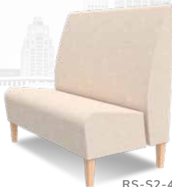
RS-S2-48-HB 48" HIGH BACK BOOTH 48" W X 28" D X 44" H