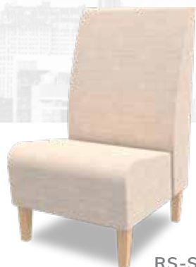
RS-S1-24-HB 24" HIGH BACK BOOTH 24" W X 28" D X 44" H