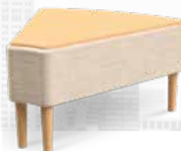
RS-45-SPN-LT 45-DEGREE WEDGE SPANNER WITH LAMINATE TOP 29" W X 30" D X 16.5" H