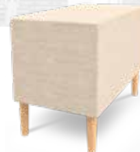
RS-SPN-ARM -1630-UPH 16" SPANNER ARM WITH UPHOLSTERED TOP 16" W X 30" D X 24" H