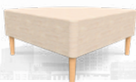
RS-90-SPN-UPH 90-DEGREE WEDGE SPANNER WITH UPHOLSTERED TOP 43" W X 30" D X 16.5" H