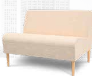
RS-S2-44 44" DOUBLE-SEAT ARMLESS UNIT 44" W X 32" D X 32" H