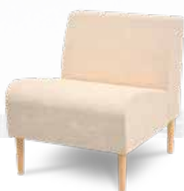
RS-S1-28 28" SINGLE-SEAT ARMLESS UNIT 28" W X 32" D X 32" H