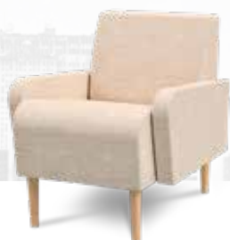
RS-C-SL-22 22" CHAIR SLOPED ARMS 30" W X 32" D X 32" H