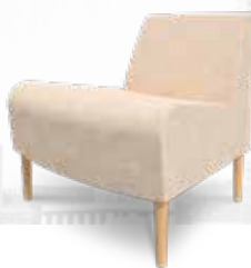
RS-30-OW 30-DEGREE OUTSIDE WEDGE SEAT 39.5" W X 32" D X 32" H