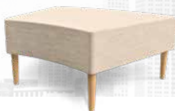
RS-30-SPN-UPH 30-DEGREE WEDGE SPANNER WITH UPHOLSTERED TOP 39" W X 30" D X 16.5" H