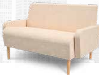
RS-L-SL LOVESEAT SLOPED ARMS 52" W X 32" D X 32" H