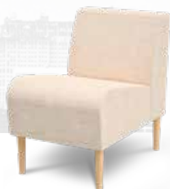
RS-S1-22 22" SINGLE-SEAT ARMLESS UNIT 22" W X 32" D X 32" H