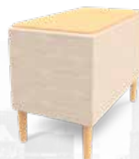
RS-SPN-ARM -1630-LT 16" SPANNER ARM WITH LAMINATE TOP 16" W X 30" D X 24" H