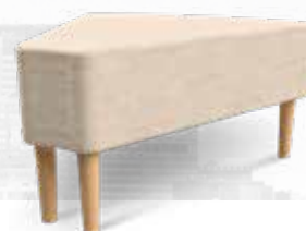
RS-45-SPN-UPH 45-DEGREE WEDGE SPANNER WITH UPHOLSTERED TOP 29" W X 30" D X 16.5" H