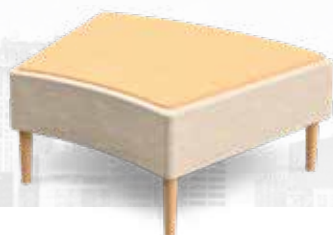
RS-30-SPN-LT 30-DEGREE WEDGE SPANNER WITH LAMINATE TOP 39" W X 30" D X 16.5" H