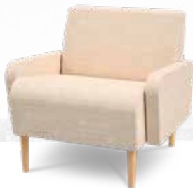
RS-C-SL-28 28" CHAIR SLOPED ARMS 36" W X 32" D X 32" H