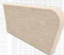
RS-ARM-SL-LA LEFT SLOPED ARM AND RS-ARM-SL-RA RIGHT SLOPED ARM AND