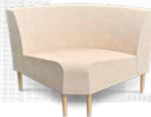
RS-CNR CORNER SEAT UNIT 59" W X 32" D X 32" H

Custom Embroidered Logos and Brands can be added to any upholstered Transformations Product.