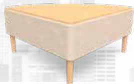
RS-90-SPN-LT 90-DEGREE WEDGE SPANNER WITH LAMINATE TOP 43" W X 30" D X 16.5" H