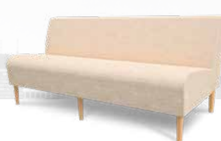
RS-S3-66 66" TRIPLE-SEAT ARMLESS UNIT 66" W X 32" D X 32" H