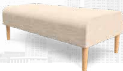
RS-OT44 44" OTTOMAN 44" W X 22" D X 18" H