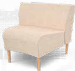
RS-30-IW 30-DEGREE INSIDE WEDGE SEAT 39.5" W X 32" D X 32" H