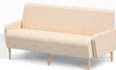
RS-S-SL SOFA SLOPED ARMS 74" W X 32" D X 32" H