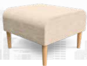
RS-OT22 22" OTTOMAN 22" W X 22" D X 18" H